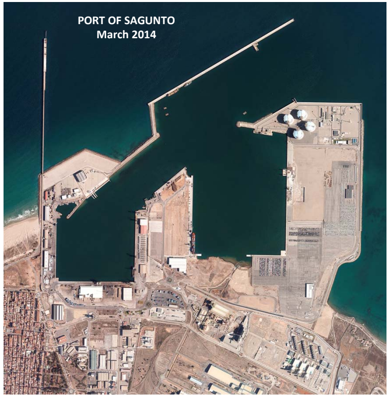
PORT OF SAGUNTO March 2014