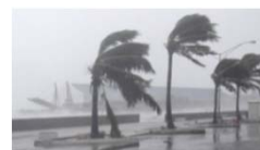
ADVERSE WEATHER CONDITIONS

According to IMO regulations on the matter, marine forecast from the Spanish National Meteorological Agency (AEMET) is broadcasted in Spanish and English every two hours (GMT +15', at odd hours) by the SAR Centre at Valencia, through VHF Channel 10. Notice of the broadcast on Channel 16. These forecasts and warnings can be consulted in more detail at any time at the following address: www.aemet.es