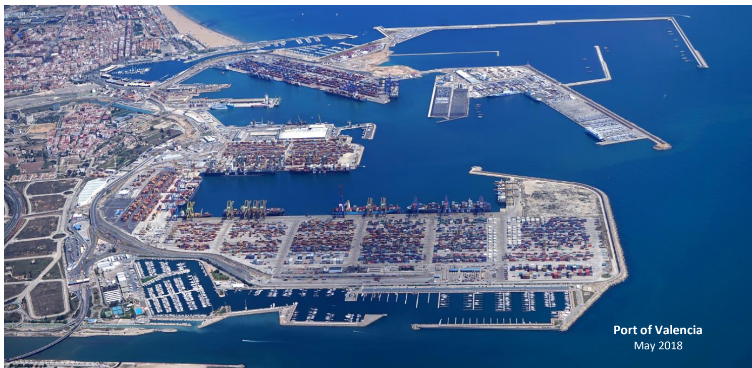
Port of Valencia May 2018