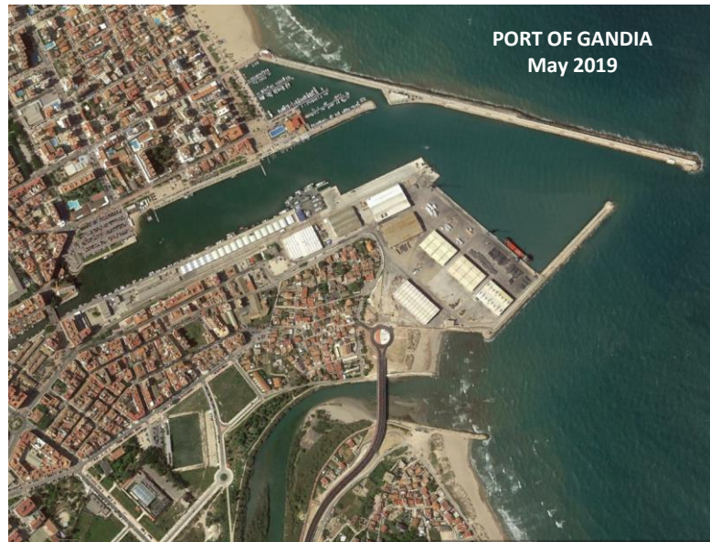
PORT OF GANDIA May 2019