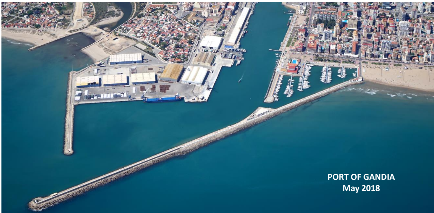
PORT OF GANDIA May 2018